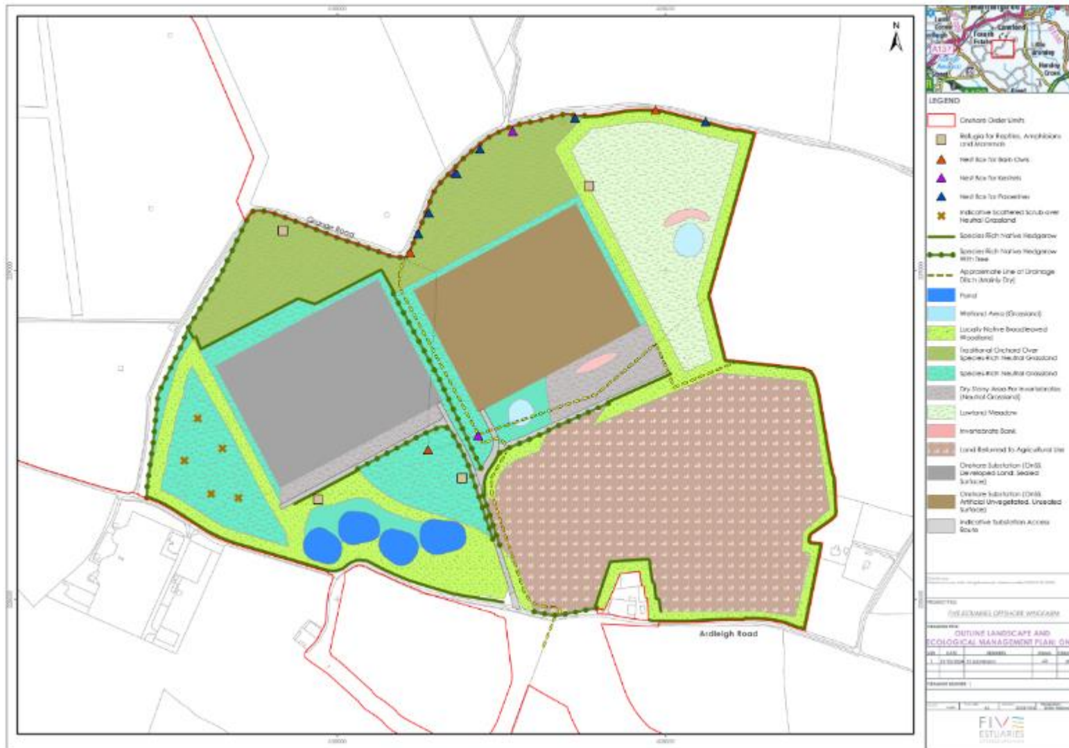
Figure 1 Outline Landscape and Ecological Management Plan: OnSS